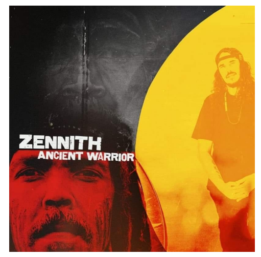
All images copyright of the artist.