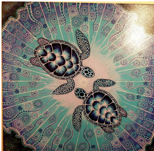
Below: Hope Vale Black Dream in Barron River by emerging Hope Vale artist Tanique Brim