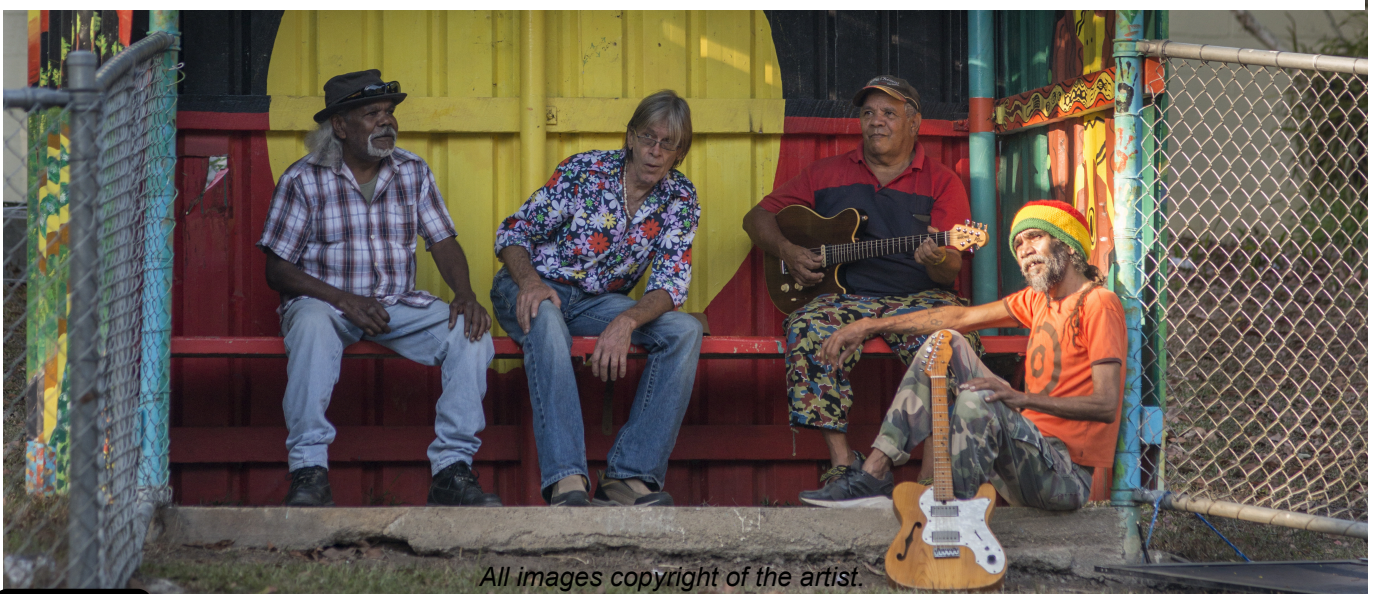
All images copyright of the artist.